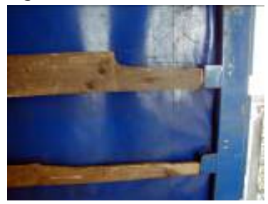
Defective hoop boards