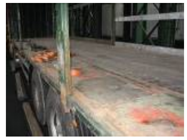
Insufficient number of anchor points